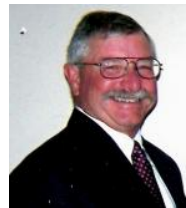
Bruce Scheopner Associated Brokers

Small acreage with incredible views of the Pine Ridge and Black Hills. Three bedroom home with three baths, living room, kitchen, dining room, and mud room. Walk out basement. Two car detached garage and storage shed. 10 acres corner lot of Deadhorse Road and Table Road.